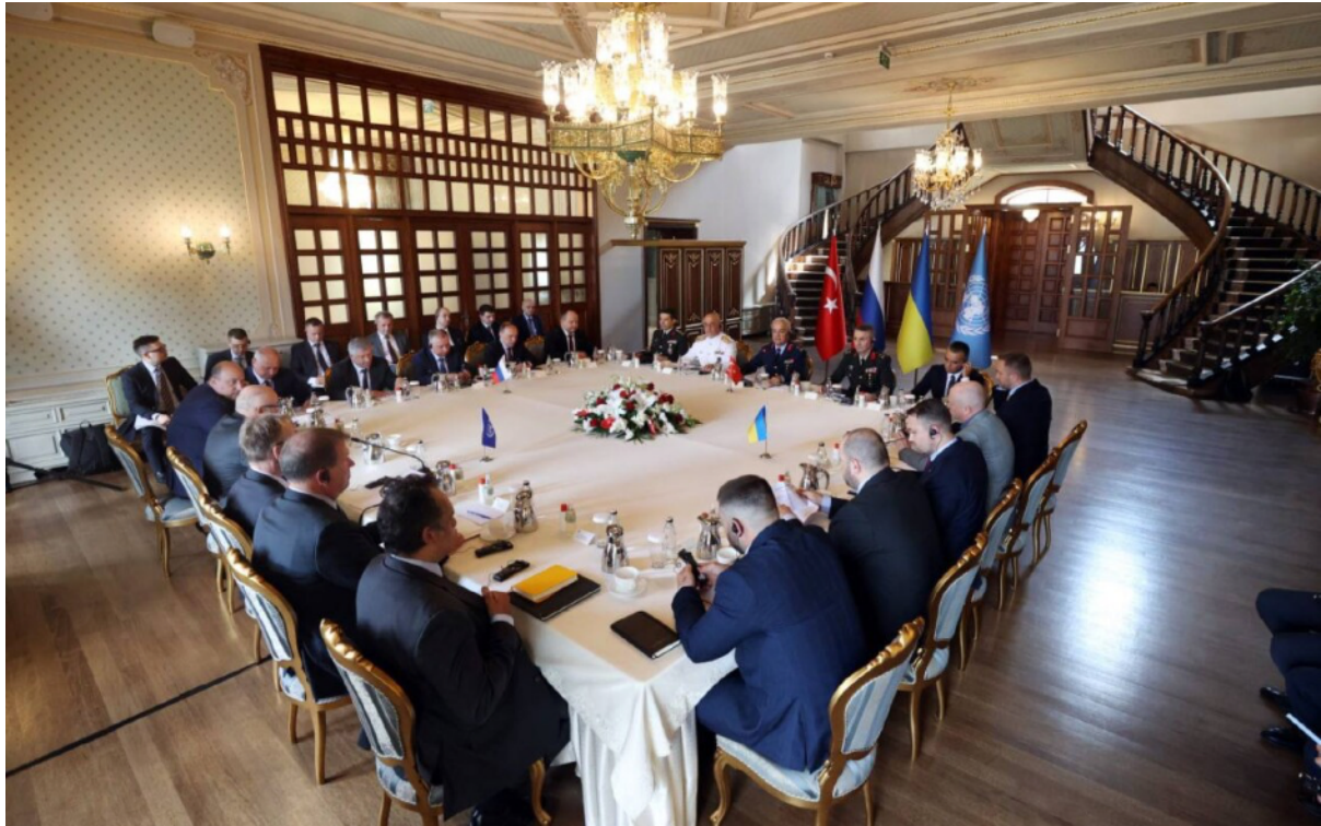
Photo: Negotiations in Istanbul regarding unblocking the export of Ukrainian grain

On July 22, in Istanbul, a Ukrainian delegation led by Minister of Infrastructure Oleksandr Kubrakov signed an agreement with the UN and Turkey called “the Initiative for the Safe Transportation of Grain and Food Products from Ukrainian Ports”. Russia signed a separate agreement with the UN and Turkey. Ukraine, better than any other state, knows what the agreements with Russia are worth, therefore, since the agreements were not signed between Russia and Ukraine, in case of their violation, the Russian Federation could not blame Ukraine, and now the aggressor country is responsible exclusively to Turkey and the UN for its further actions.