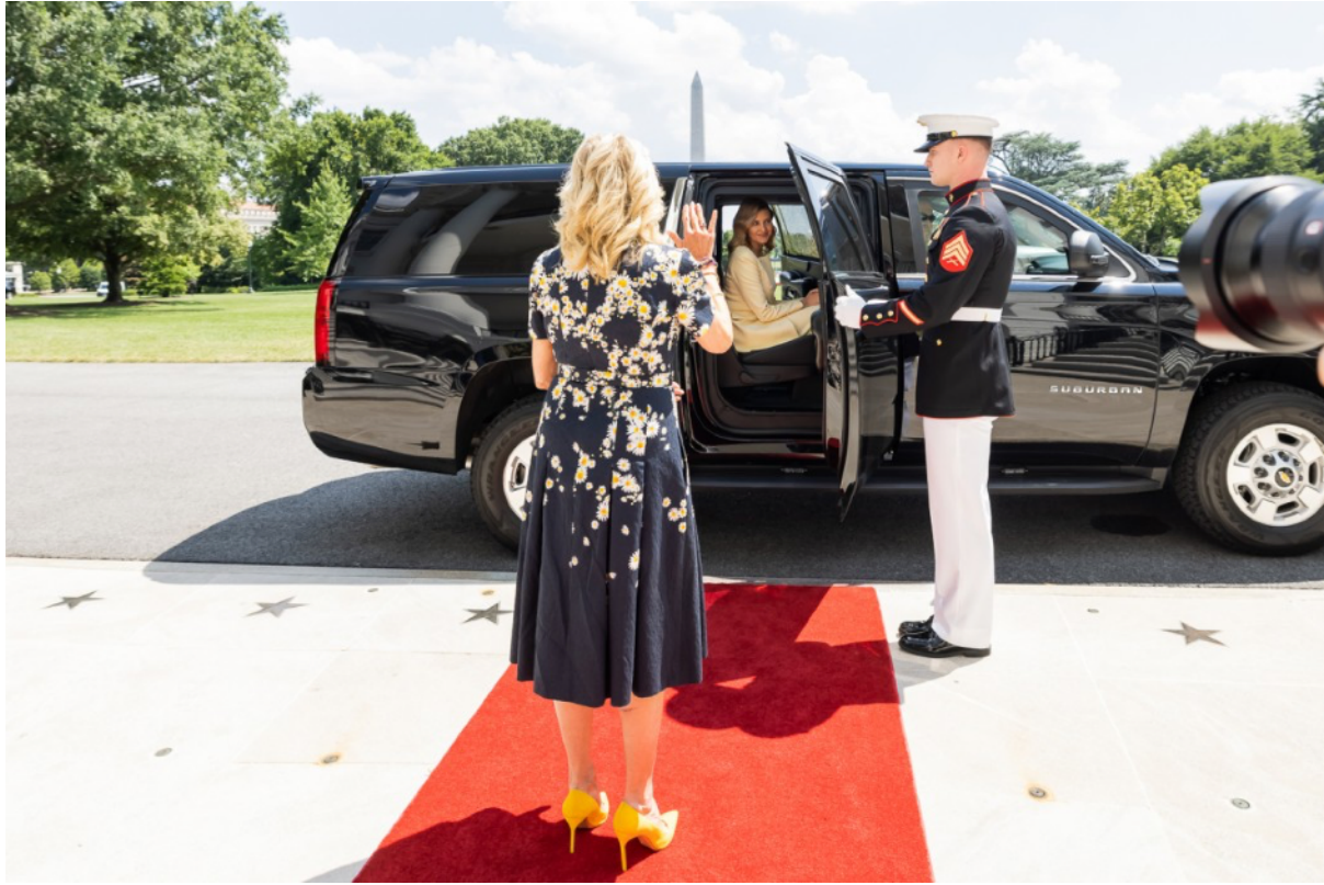
Photo: Jill Biden meets Olena Zelenska in Washington

Against the background of the all-out aggression of the Russian Federation, Ukrainian diplomacy is mobilizing the maximum set of tools to increase military, political, financial and humanitarian aid to Ukraine and keep the issue of supporting Ukraine on the agenda of partner states. The Ministry of Foreign Affairs of Ukraine has received great support from the Ukrainian diaspora, forcibly displaced citizens, world-famous actors and business representatives. Many personalities continue to publicly express their support for Ukraine, many people changed their activities to volunteering in order to contribute to Ukraine's victory over the aggressor. One of the millions of such citizens is the wife of the President of Ukraine, Olena Zelenska, whom Atlantic Council researcher Peter Dickinson dubbed "Ukraine's secret weapon."